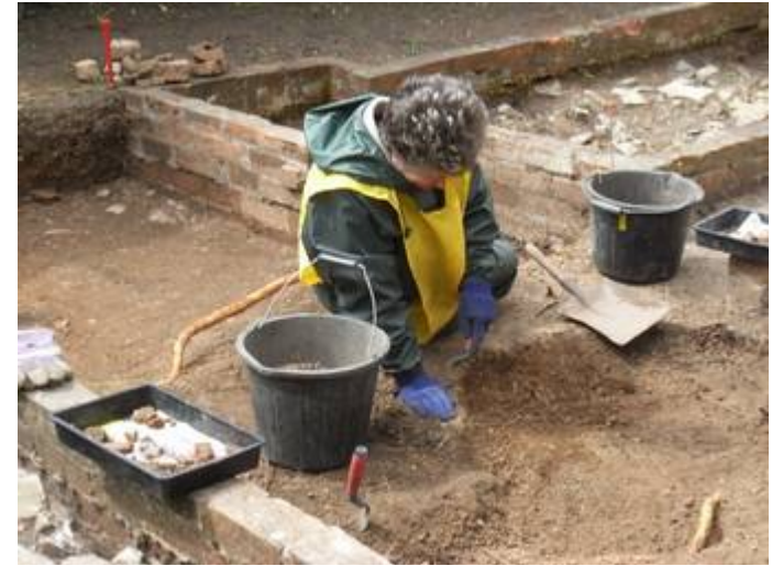
Volunteers from the Archaeology Group helping with the Shakespeare Birthplace Trust Dig for Shakespeare project at New Place in Stratford upon Avon