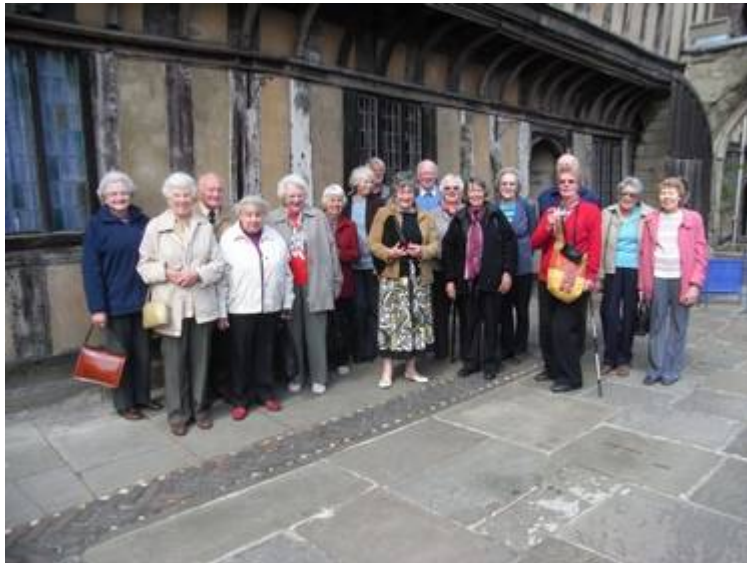
Members of the Local History Group visited the Lord Leycester Hospital in Warwick on 4th May